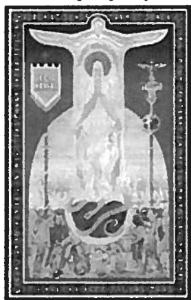
The Legion of Mary

Write to the Mail or send forms to the secretary, 100 St. John's Road, Dublin 1, or write to an army of the Legion.